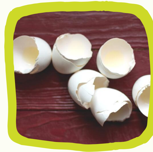
Egg Shells/ Meat Bones