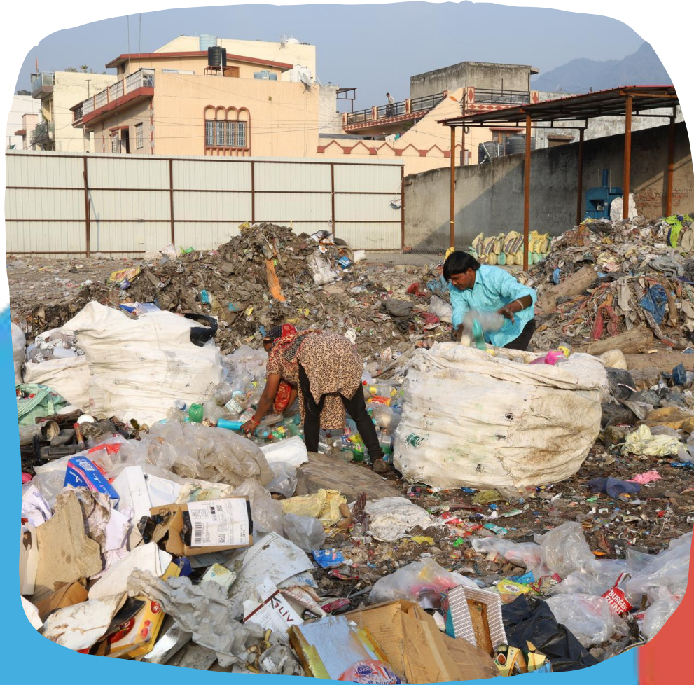
City Dump Site