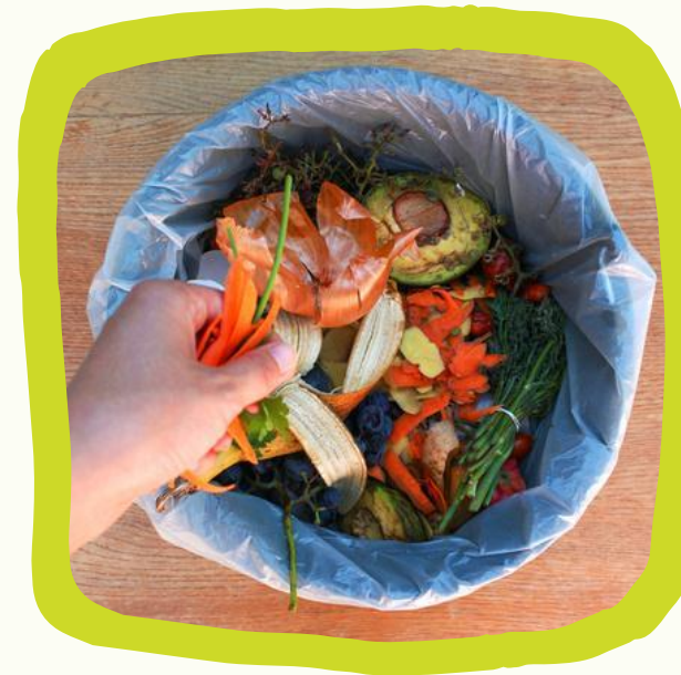
Vegetable/ Fruit peels