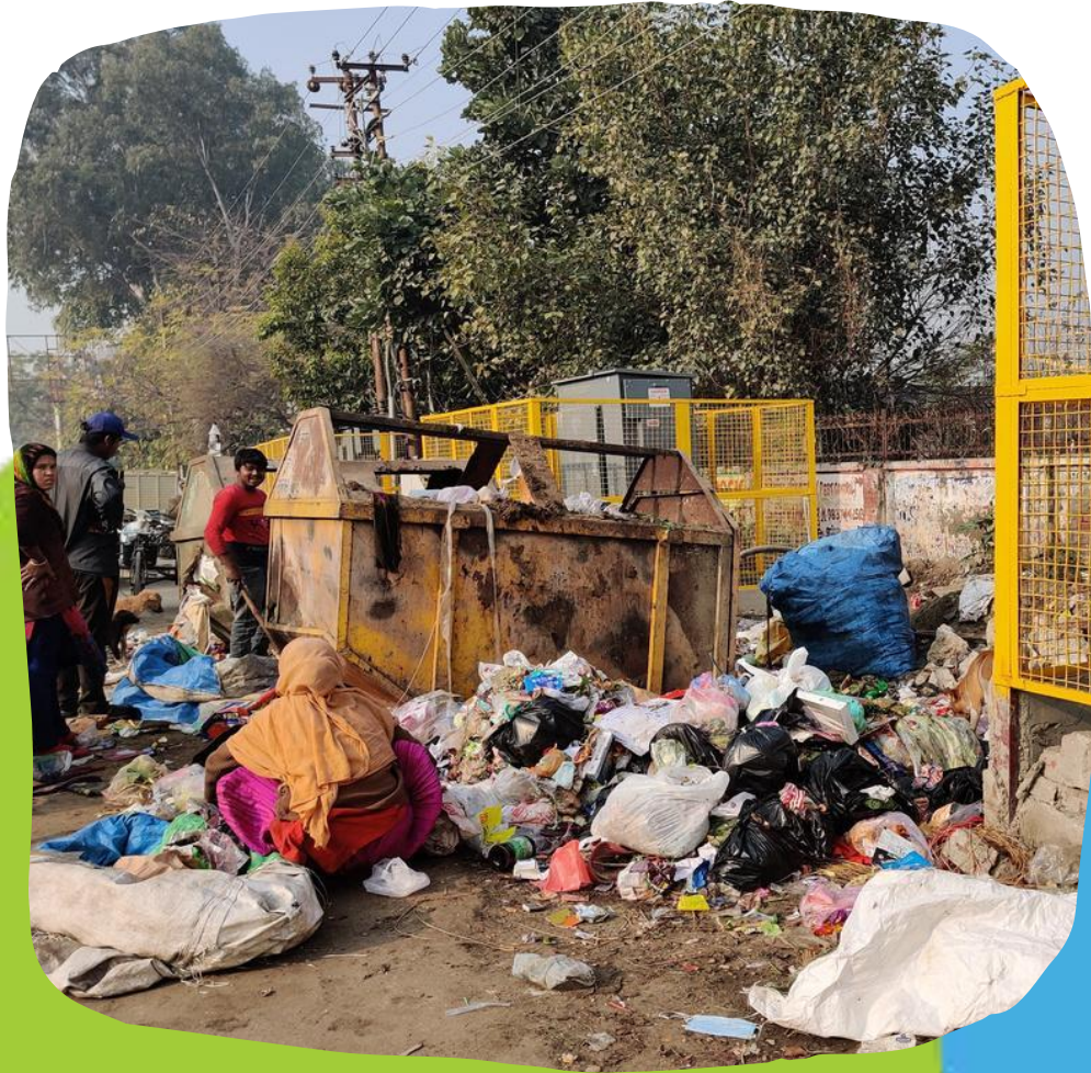
Open dumping spots