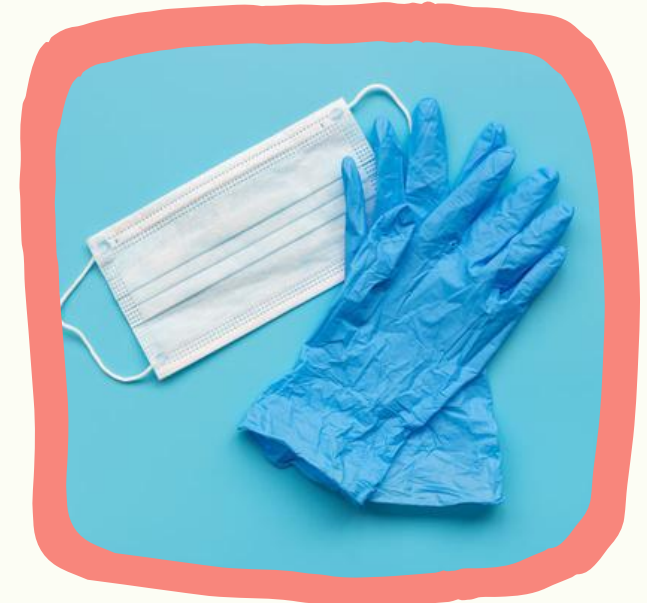
Used face mask & gloves