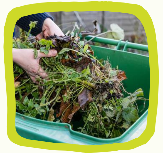
Flowers and leaves