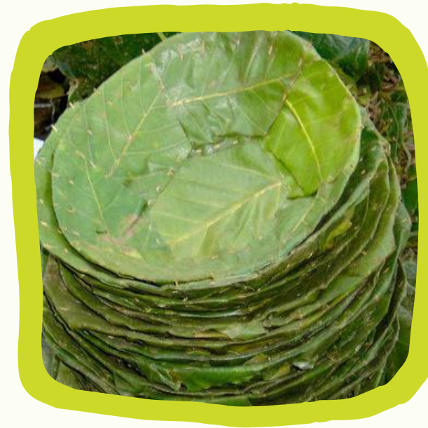
Leaf plates and bowls