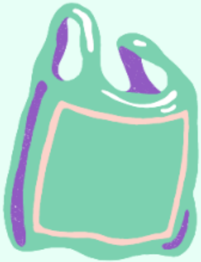
Plastic Shopping Bags

These are five common everyday single use plastic items harming our environment. Which ones have you used this month?