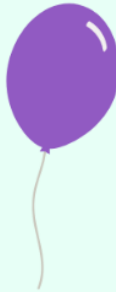
Balloons and Balloon Sticks